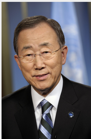
Secretary-General Ban Ki-moon

Apart from these familiar faces, we also welcome some new speakers and discussants to joint this year conference: